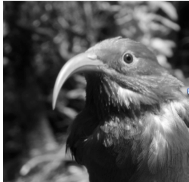
An `Iwi that the team captured in one of their mist-nets.

“Food web” is just a fancy term for who eats whom in an ecosystem—in this landscape leaves in the forest canopy are eaten by arthropods such as caterpillars, which are eaten by other arthropods like spiders; birds eat both caterpillars and spiders as well as plant material like fruit and flower nectar. When a generalist predator like the black rat is introduced into this system, any and all levels of the food chain can be affected. Black rats eat seeds and seedlings, fruit and nectar, caterpillars and spiders, and will even eat the eggs and young of birds if they can find them. Each member of our team is tasked with determining what impact fragmentation